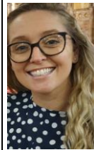
EYFS Lead/Reception Teacher